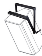
Vertical flying cradle CP-XY8VC1

Speakers can be flown vertically or horizontally