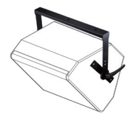
Horizontal flying cradle CP-XY8VC1