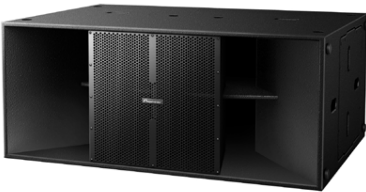
XY-218HS Dual 18-inch horn-loaded subwoofer