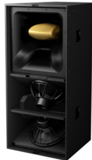
XY-3B High powered speaker

Features and specifications of the products described or illustrated in this specification sheet are correct at the time of printing but could change as production changes might occur. This specification sheet may contain typographical errors and the colours of the depicted products may deviate slightly from reality. Consult your Pioneer dealer to ensure that actual features and specifications match your requirements. This specification sheet may contain references to products that may or will not be available in your country.